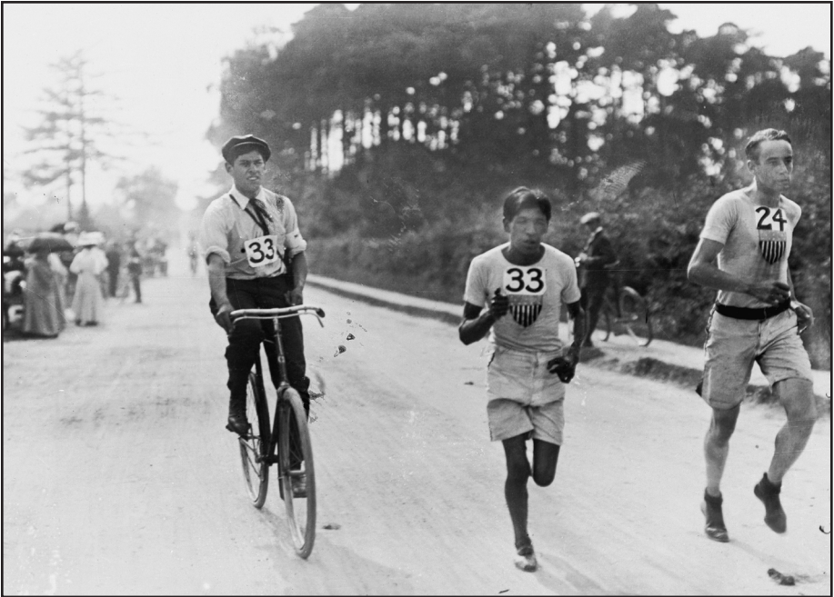
Figure 1. Louis Tewanima (center) running alongside Neil McCarthy (left) and Joseph Forshaw in the 1908 London Olympic Marathon, UB7515OINP.