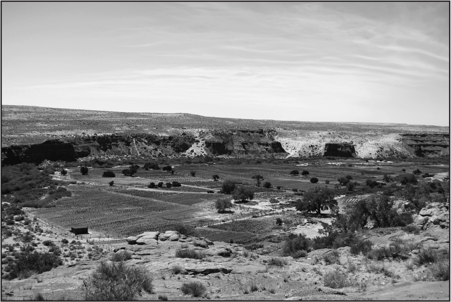
Figure 3. Albert Yava recalled that Hopi farmers from Orayvi would run to fields at Moencopi (pictured), take care of their crops, and run back to Orayvi in the same day (a total distance of nearly 100 miles.

discipline” utilizing “teamwork, a strong work ethic, and perhaps most importantly, deference to authority in the form of a coach or game official that might ready one for a compliant workforce.” 17