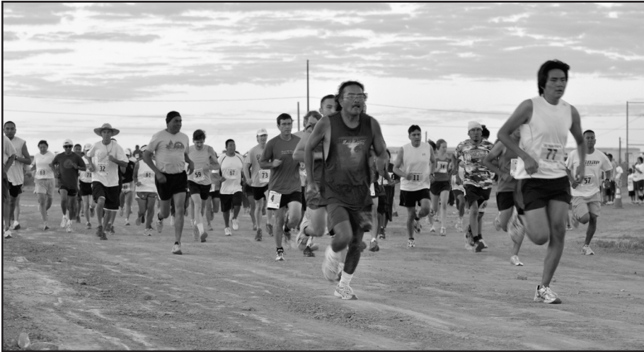
Figure 6. Runners at the 37th annual Louis Tewanima Footrace on Second Mesa, Shungopavi, AZ, 2010.